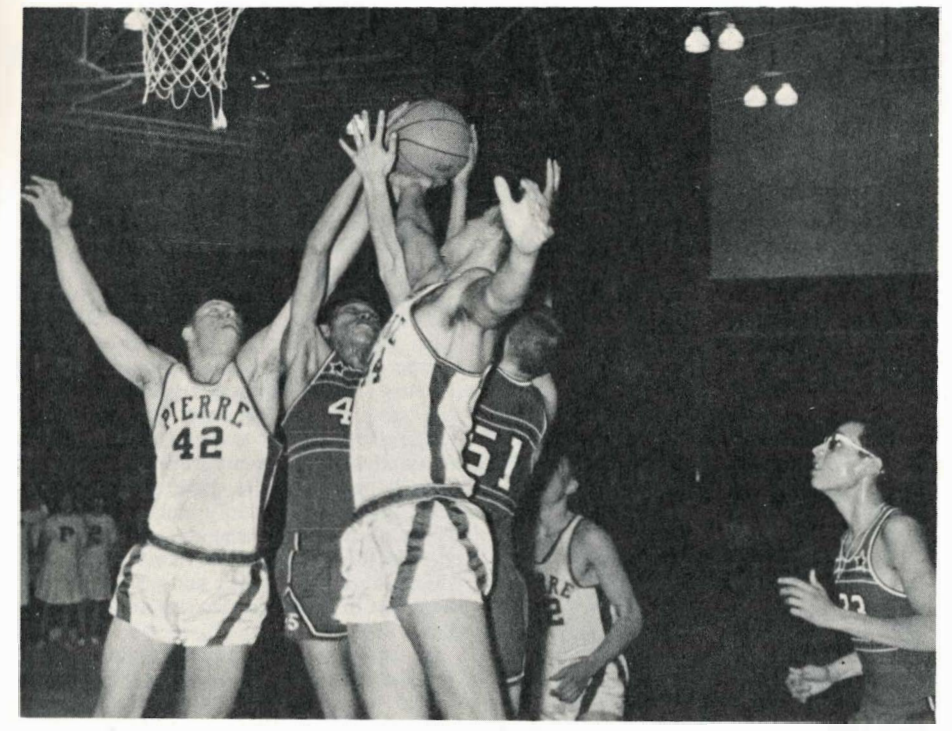
Pierre Governors and Pine Ridge game at Pierre