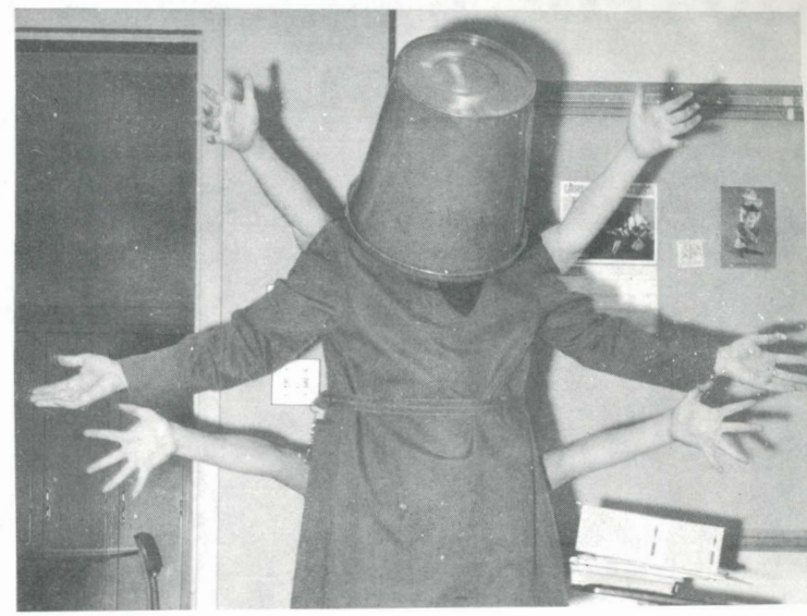
Today is DUMB DAY, if you have been good all year, the MAGIC DUMMY will put something in your locker . . . MAYBE HE ALREADY HAS!

Following the game there will be a "Berfunkle Dance" in the study hall. Girls are to ask their favorite beau. The excitement will be centered around a general Berfunkle theme. During band breaks there will be a "diddle time" with competitive games among the three classes. One class will be declared "Diddle Champions of 1969". Tickets will go on sale next week.