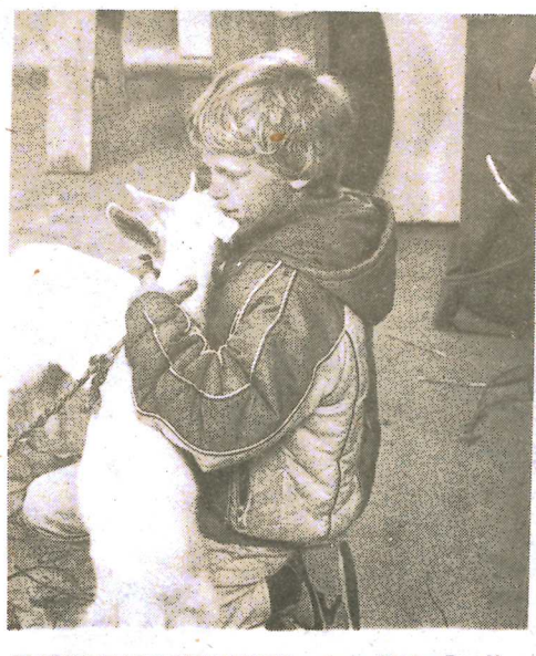
ELEMENTARY STUDENTS enjoyed "Ag Day" an FFA project.