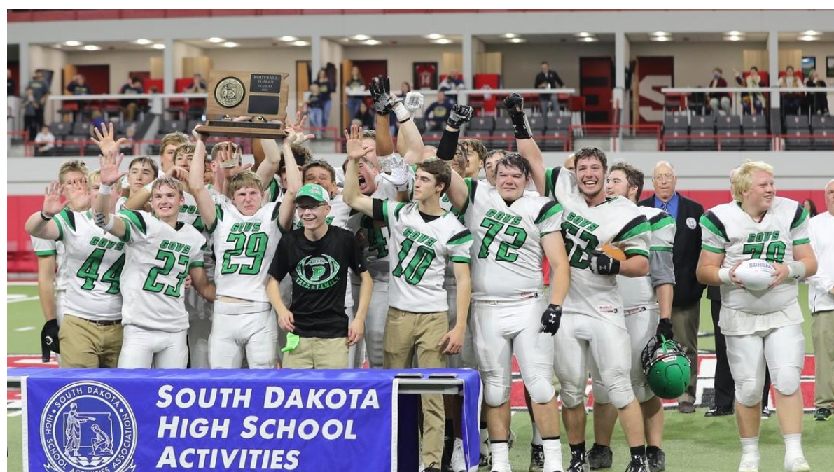
Athletes on the Pierre Governor's football team celebrate their five-peat at the Dakota Dome

Although they ended the regular season with a loss to Brookings, they once again found their feet and beat Watertown and Aberdeen Central in the playoffs for a spot at the dome. The championship game against Tea was off to a rough start, but they battled back from a halftime score of 7-21. The boys won 30-27 with an interception, leading to a winning field goal with 4 seconds to go. This was their fifth title in five years!